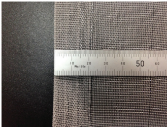
Typical weft 50 mesh & typical warp 25 mesh

Hortcraft Quarantine Mesh integrates two methods for the control of Greenhouse pests such as thrip, aphids, leaf miner and many other insects. The dual protection begins with the mesh creating an optical deterrent that blinds and repels the insects before they reach the mesh covered area, with the fine mesh size significantly reducing the number of pests entering the structure, whilst still maintaining adequate airflow. This net has the ability for growers to yield better quality crops, flowers or foliage; lessening the need for spraying harsh chemicals and pesticides. This net can be used in all stable structures for vegetables, herbs and flowers.